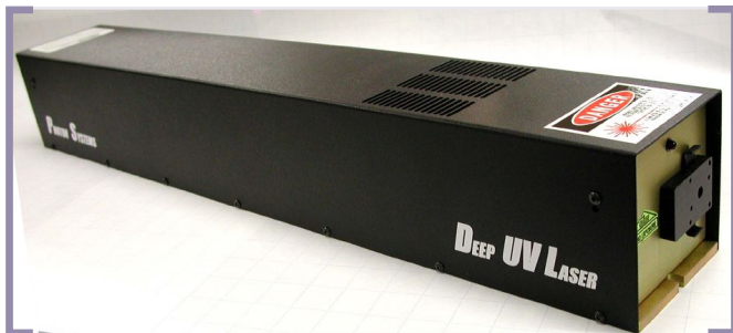
Series 70 Laser with integrated controller